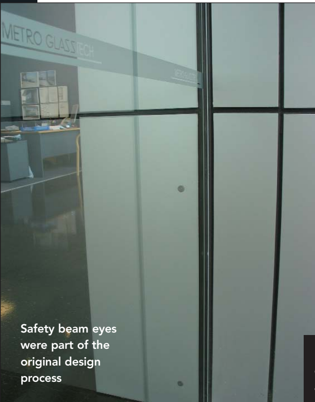
Safety beam eyes were part of the original design process